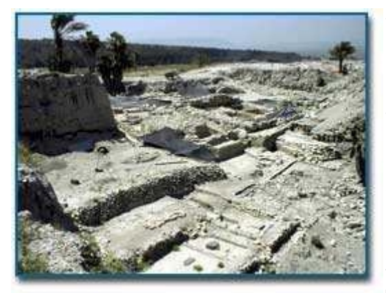
Archeological excavation at Megiddo