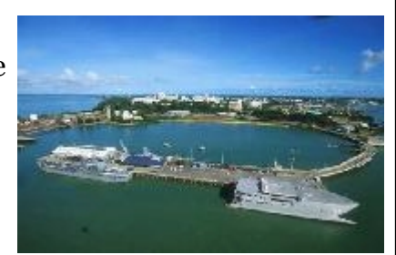
Pearl Harbor as it looks today

There are many parallels between this fateful day and another major turning point in our history, the bombing of Pearl Harbor on Dec. 7, 1941, referred to by President Franklin D. Roosevelt as a "day of infamy." Both were absolutely shocking and sickening visual spectacles. But rather than the world only seeing black-and-white film footage long after the attack, this time much of the world was able to watch on color television the real-time